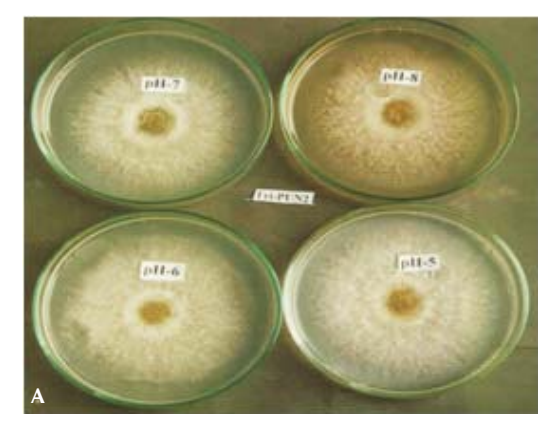
Table 5: Effect of pH on sporulation of Trichoderma spp.